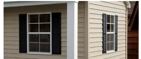
24 X 36 WINDOWS WITH POLYVINYL SHUTTERS