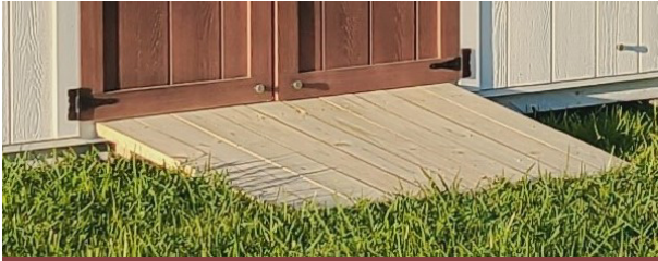
5 X 4 PRESSURE-TREATED RAMP