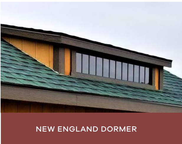
NEW ENGLAND DORMER