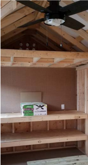
DOUBLE WORKBENCHES AND LOFT