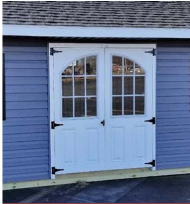
9-LITE ARCH FIBERGLASS DOORS