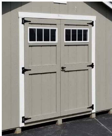
4-LITE DURATEMP DOORS