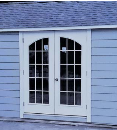
15-LITE ARCH FIBERGLASS DOORS