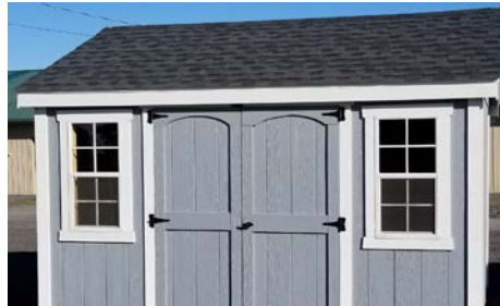
18 X 36 WINDOWS WITH 3" AZEK TRIM