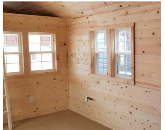
KNOTTY PINE INTERIOR WITH OUTLETS