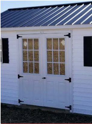
9-LITE FIBERGLASS DOORS