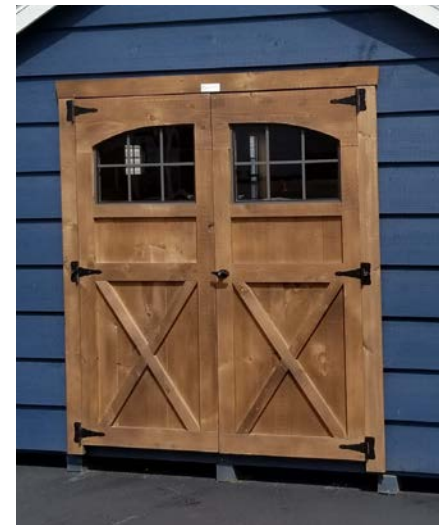
6-LITE ARCH PINE DOORS