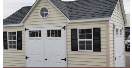
18 X 27 WINDOWS WITH POLYVINYL SHUTTERS