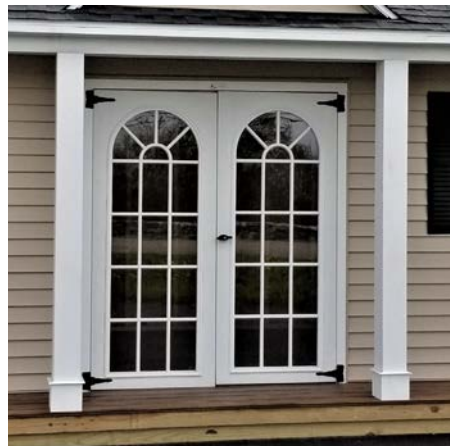
17-LITE FIBERGLASS DOORS