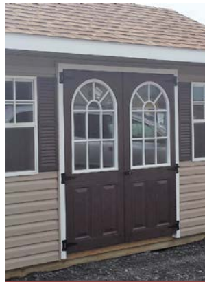
11-LITE PAINTED FIBERGLASS DOORS