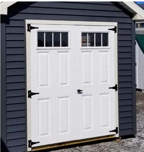
4-LITE FIBERGLASS DOORS