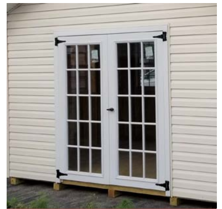
15-LITE FIBERGLASS DOORS