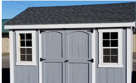
18 X 36 WINDOWS WITH 3" TRIM