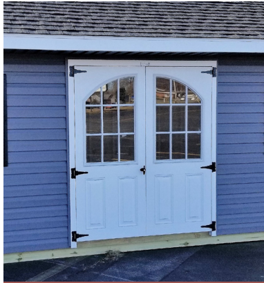
9-LITE ARCH FIBERGLASS DOORS