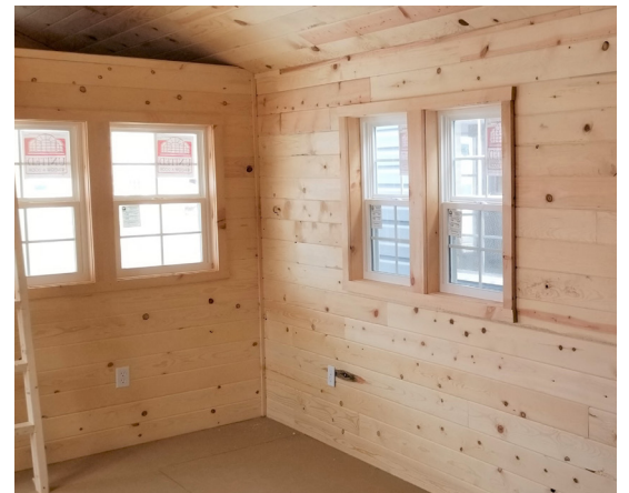
KNOTTY PINE INTERIOR WITH OUTLETS