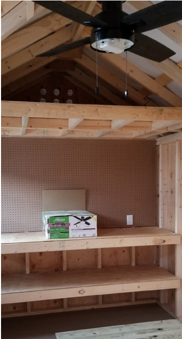
DOUBLE WORKBENCHES AND LOFT