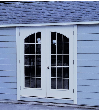
15-LITE ARCH FIBERGLASS DOORS