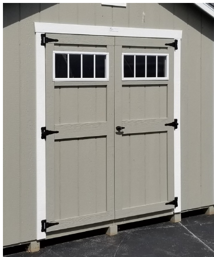
4-LITE DURATEMP DOORS