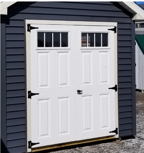
4-LITE FIBERGLASS DOORS