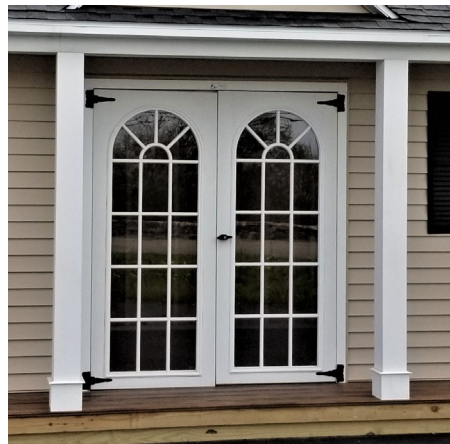
17-LITE FIBERGLASS DOORS