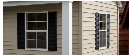
24 X 36 WINDOWS WITH POLYVINYL SHUTTERS