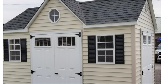
18 X 27 WINDOWS WITH POLYVINYL SHUTTERS