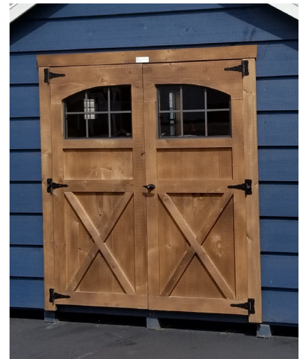
6-LITE ARCH PINE DOORS