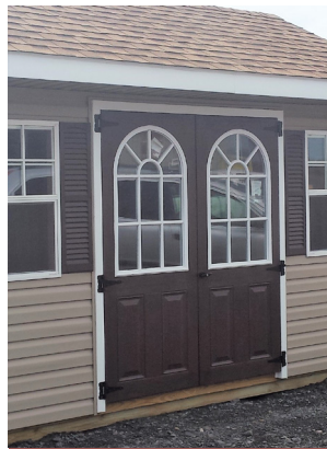
11-LITE PAINTED FIBERGLASS DOORS