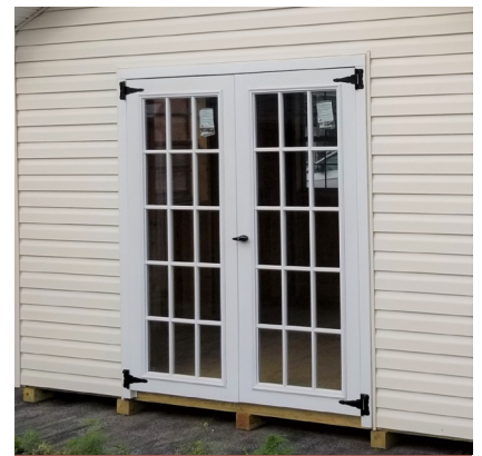
15-LITE FIBERGLASS DOORS