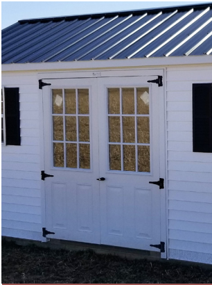
9-LITE FIBERGLASS DOORS